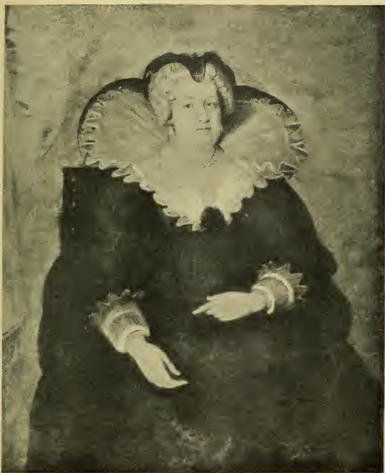
MARIE DE MEDICI